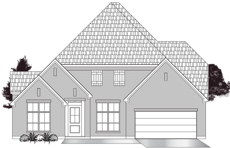
· ELEVATION A2 ·