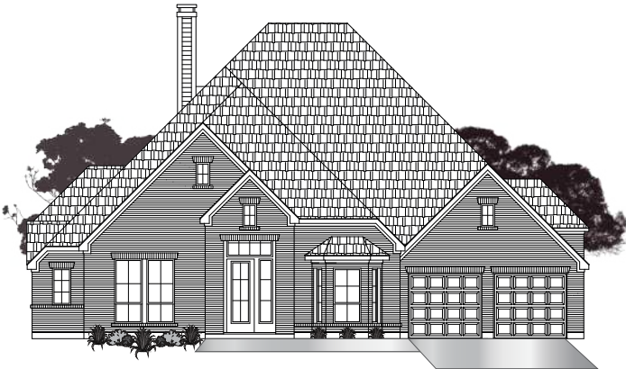
· ELEVATION A2 ·