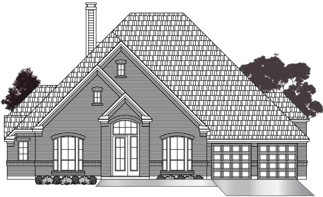
· ELEVATION A1 ·