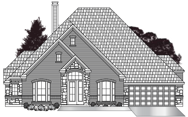
· ELEVATION B1 ·