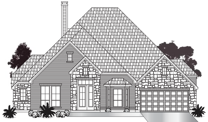
· ELEVATION B2 ·