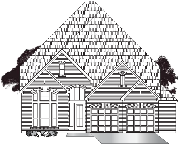
• ELEVATION A1 •