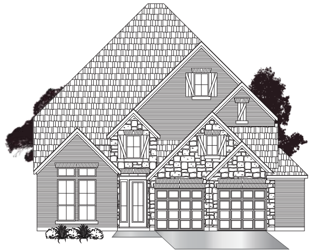
• ELEVATION B2 •