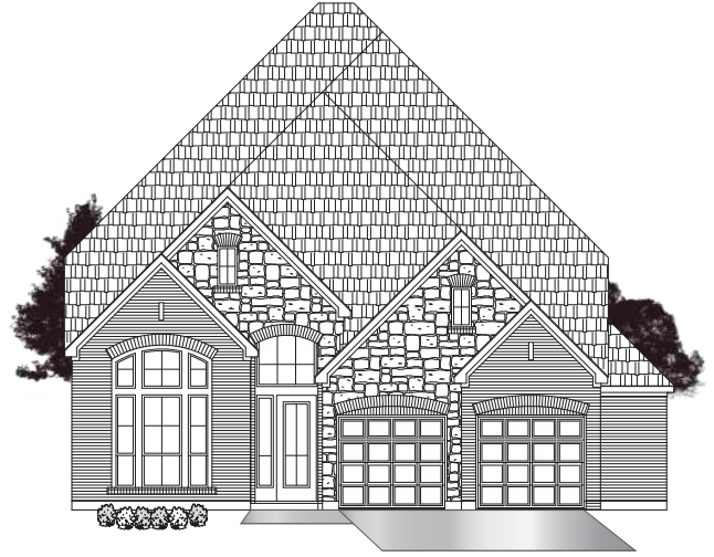
• ELEVATION B1 •