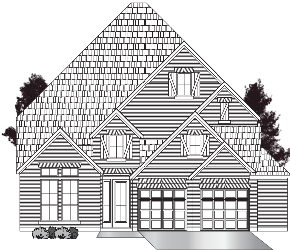
• ELEVATION A2 •