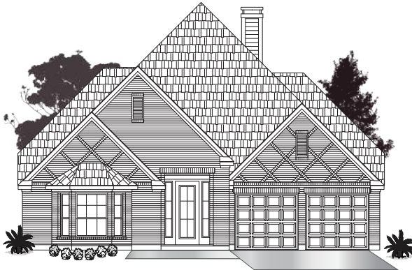
· ELEVATION A1 ·