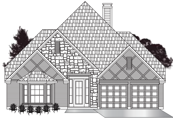
· ELEVATION B1 ·