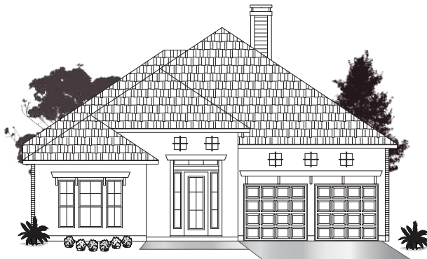
· ELEVATION D1 ·