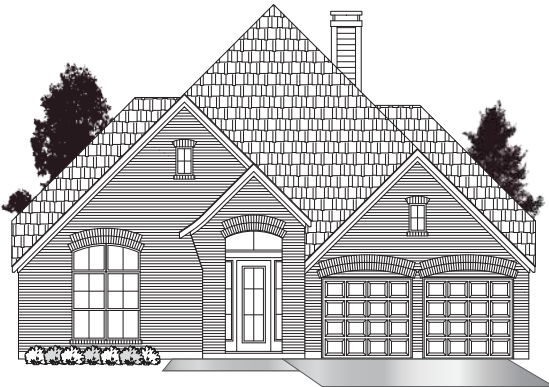
· ELEVATION A2 ·