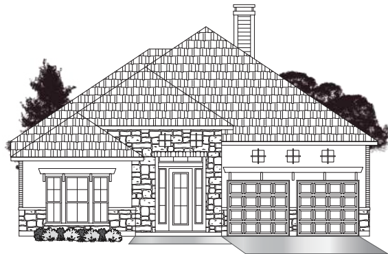
· ELEVATION D2 ·