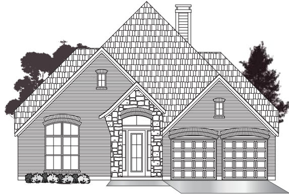
· ELEVATION B2 ·