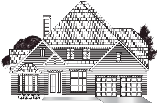
• ELEVATION A1 •