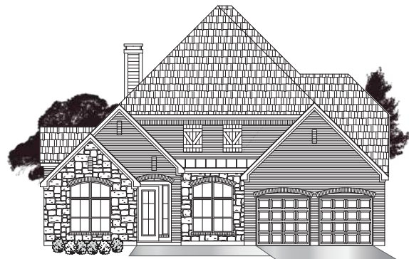
• ELEVATION B2 •