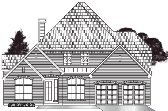
• ELEVATION A2 •