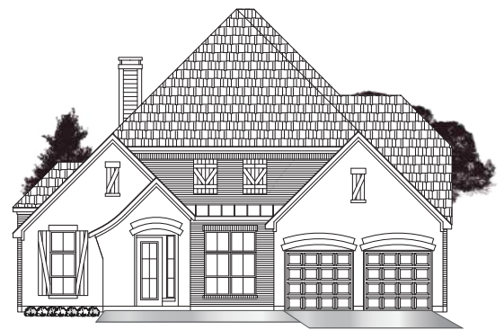
• ELEVATION D1 •