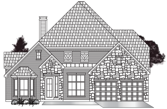
• ELEVATION B1 •