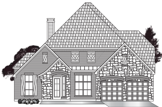
• ELEVATION C1 •