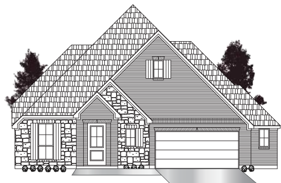
· ELEVATION B2 ·