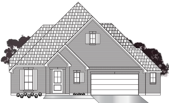
· ELEVATION A2 ·