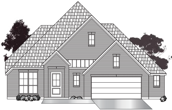
· ELEVATION A1 ·