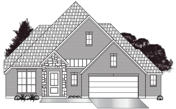
· ELEVATION B1 ·