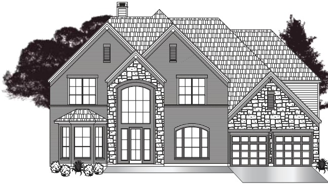
· ELEVATION B1 ·