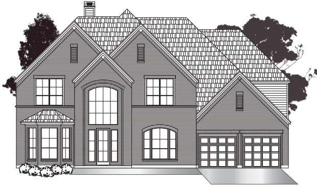
· ELEVATION A1 ·