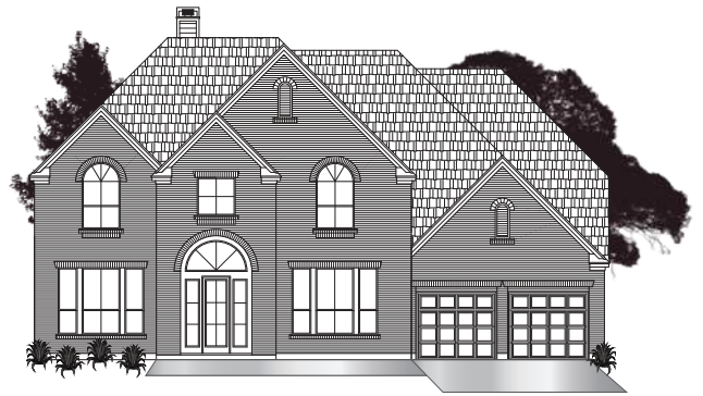
· ELEVATION A2 ·