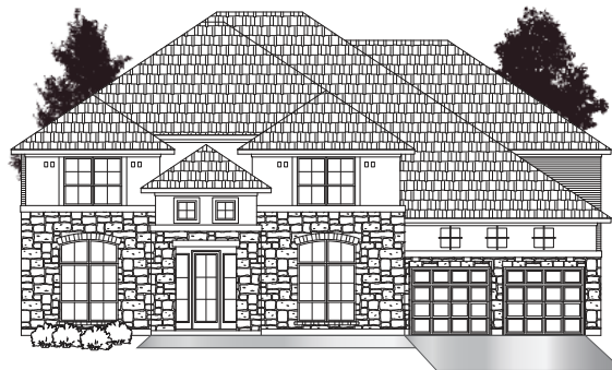
· ELEVATION D3 ·