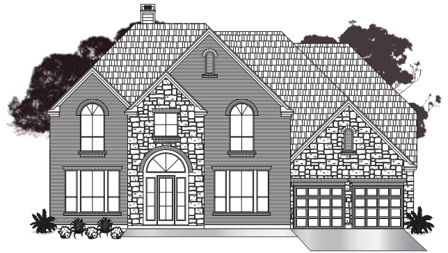
· ELEVATION B2 ·