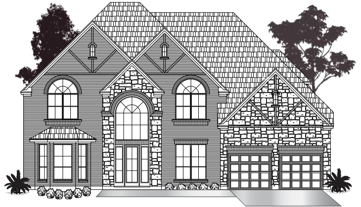
• ELEVATION B2 •