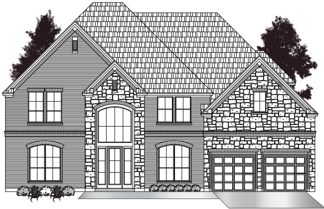
• ELEVATION B1 •