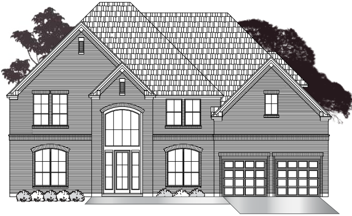
• ELEVATION A1 •