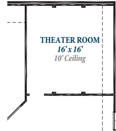
OPTIONAL THEATER ROOM Adds additional 267 square feet