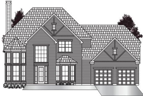
• ELEVATION A3 •