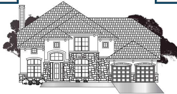
• ELEVATION D3 •