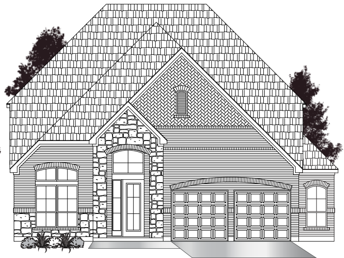
· ELEVATION B2 ·