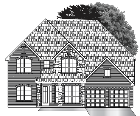
• ELEVATION B3 •