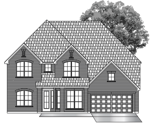
• ELEVATION A3 •