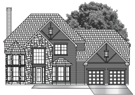
• ELEVATION B3 •