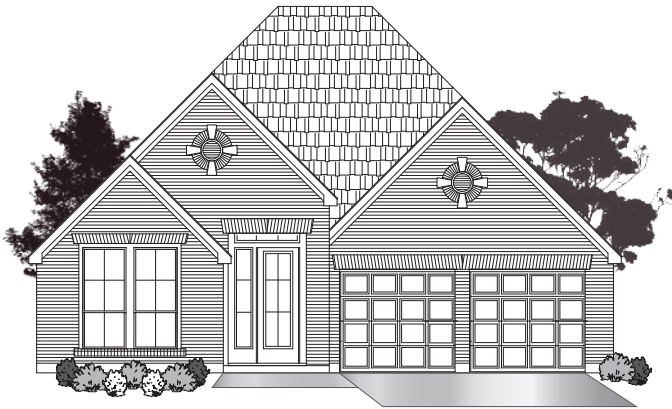
· ELEVATION A2 ·