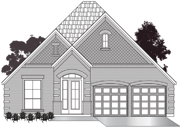
· ELEVATION A1 ·