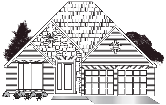
· ELEVATION B2 ·