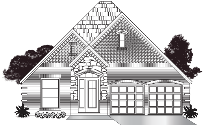
· ELEVATION B1 ·